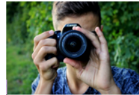
Shutterbugs at Lee Richardson Zoo in Garden City

Registration begins at 8:30 am – see information below