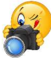
Photo Mount Boards & Protective Sleeves

Judging for Style Revue has been changed to July 8 th starting at 9am. The Style Revue & Talent Show will remain on July 9 th at 5:30pm. We will be at the Elementary School for both judging and the public Style Revue.